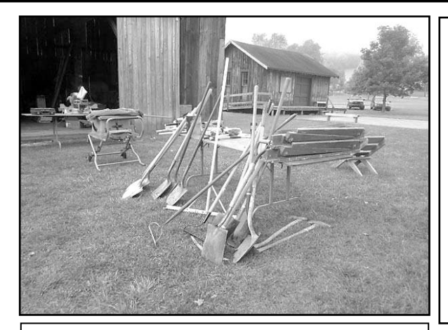
Crook Farm School Program

The Bradford Landmark Society is 501c3 non-profit organization.